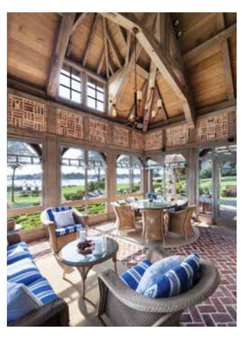
(above) A sun-soaked screened porch boasts French-style timberwork with brick infill and flooring and 180-degree views of the harbor. (below) This new English Tudor façade flaunts an elaborate array of textures and materials and a compelling variation of traditional forms.

a rounded TV, special modeling systems and many other features, was completed in record time (five and a half months with Peerless Construction as the general contractor) and required special approvals from the historic district commission.